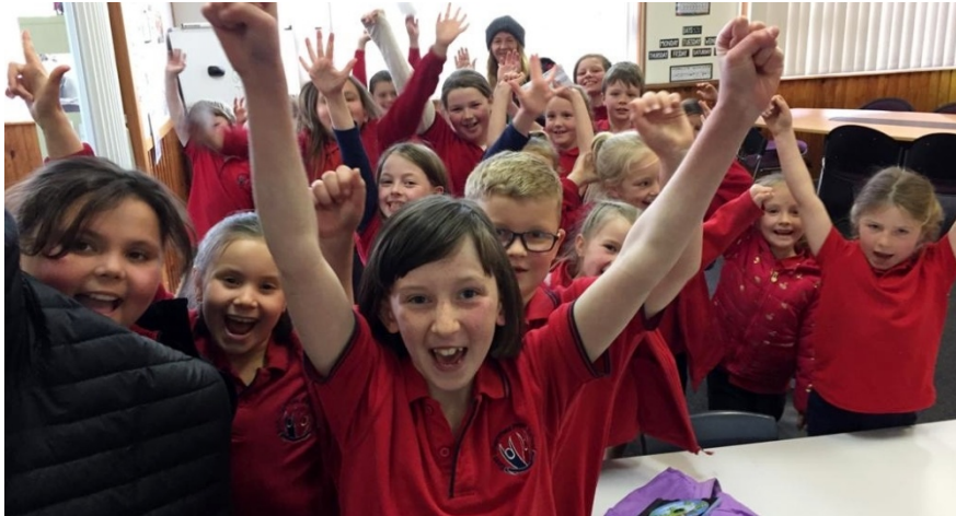
The enthusiastic group - waiting for a lolly at the end of the bridge session!